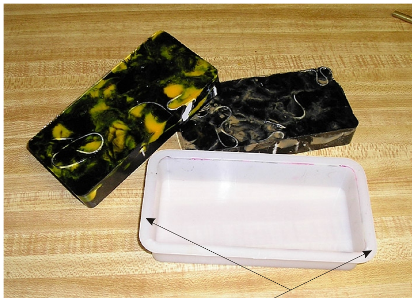
Flange of mold

When the ribbon is totally cured (stiff, like Fritos and generally allowed to sit overnight). The colors are now ready to be mixed.