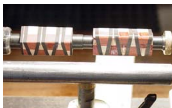
Ready to turn

We are now ready to put our blanks on the lathe so that we can turn, sand and finish them.