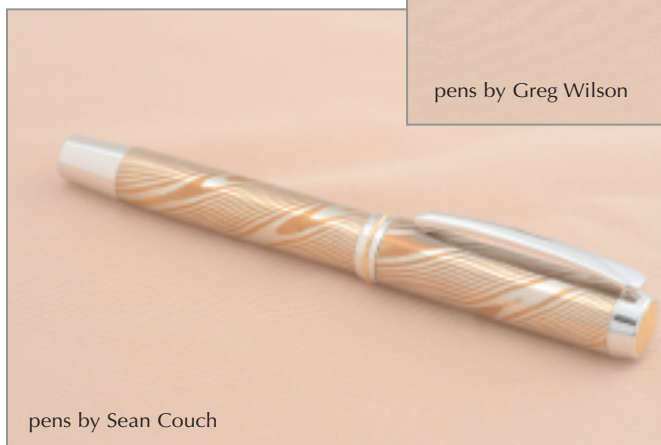
pens by Sean Couch

partly to the pressure pen makers have exerted on kit manufacturers), although the finished pen must be something more than the kit assembled as is—it must bear the artistic signature of the prospective member. And, of course, it must also function well as a writing instrument. A five-member council votes on admission.