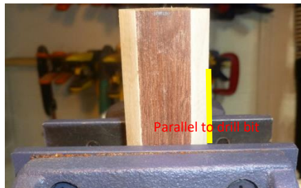
Parallel to drill bit