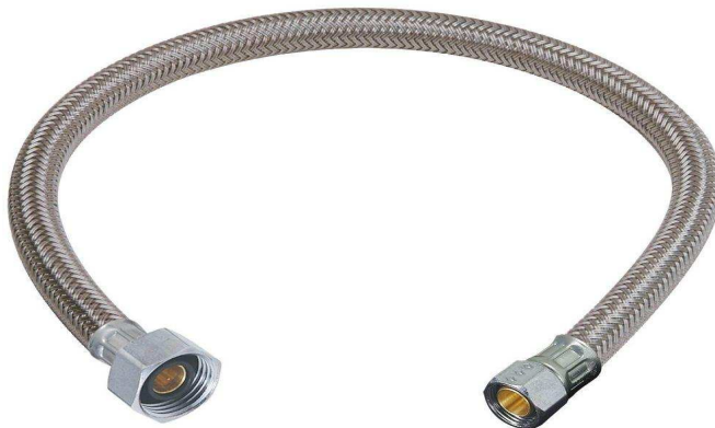
3/8" Faucet Connector