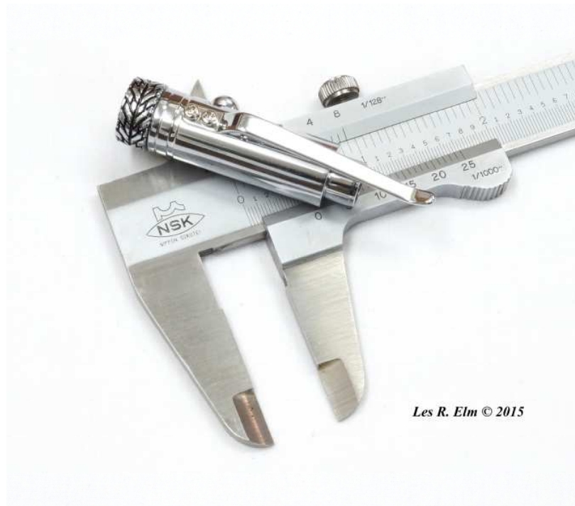
Finial Section Measurement at 0.495"