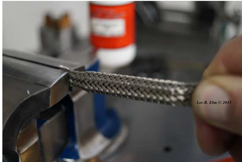
Holding Tension on the Nylon Braid