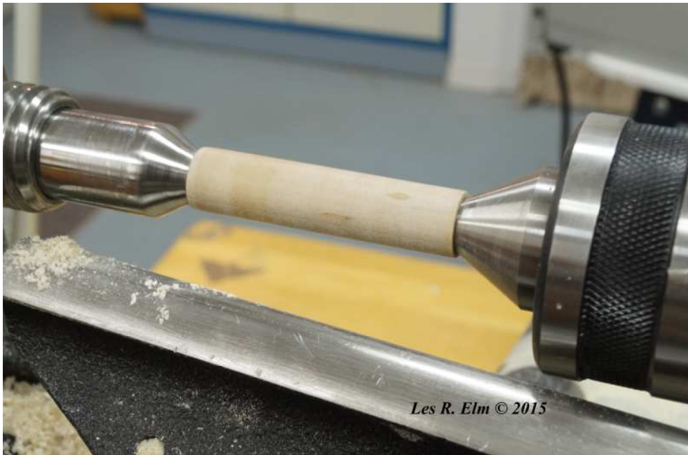
.500" Dowel Turned to Final Dimension of 0.430"