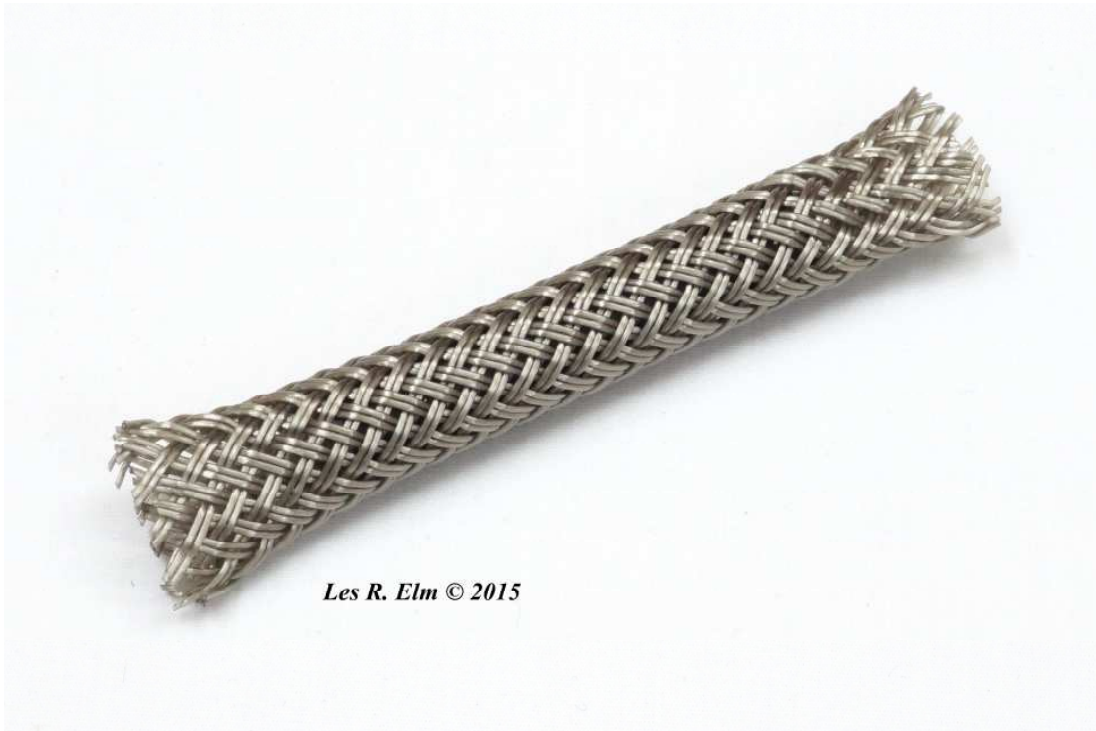
Insert the Tube Centered into the Nylon Braid