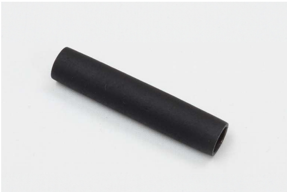
0.430" Diameter Dowel Painted Black