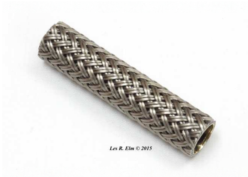
Nylon Braid Pen Blank Ready for Components

*Do not use a Pen Mill as it will rip the nylon braid from the blank ends!