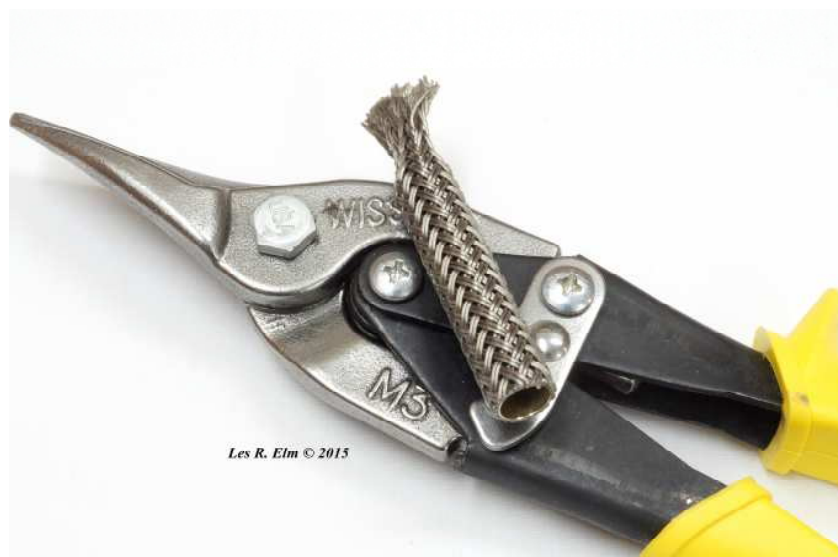
Trimming Nylon Braid With Metal Sheers