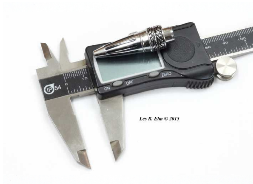
Nib Section Measurement at 0.495"