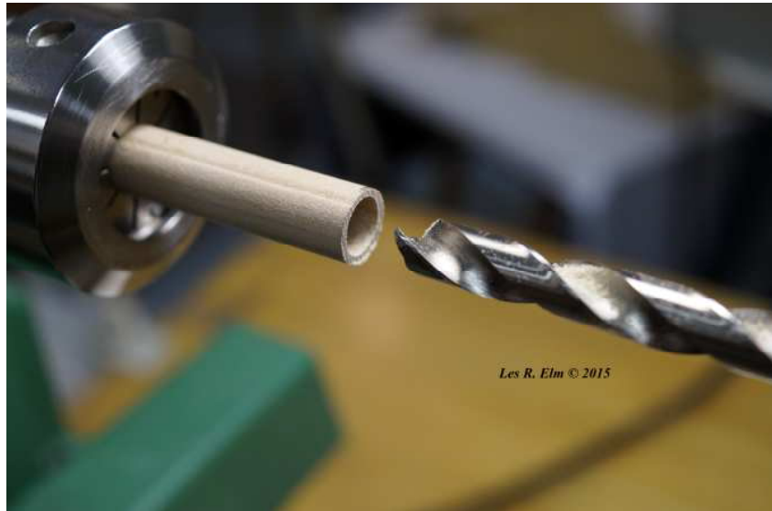
3/8" Hole Drilled through 1/2" Dowel