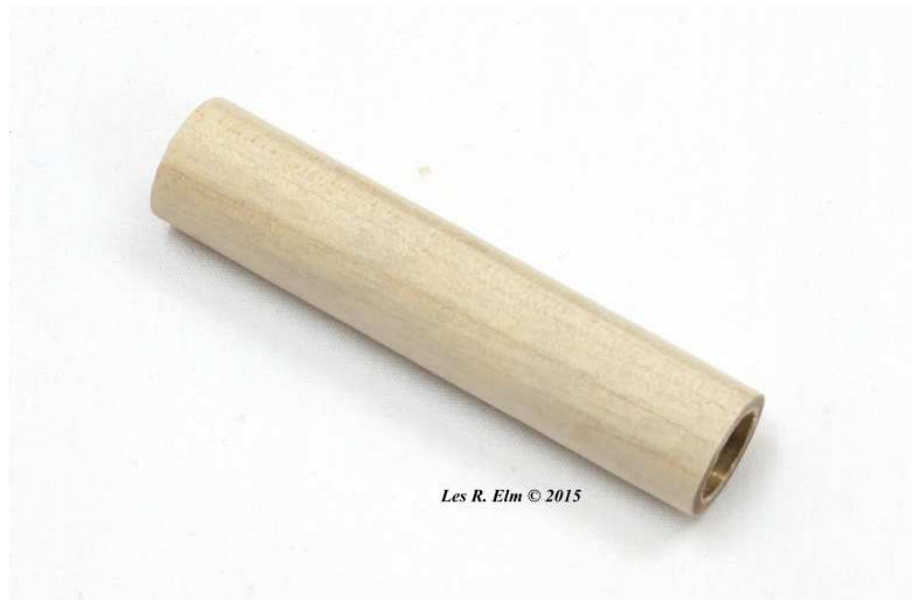
Brass Tube Anchored in Dowel