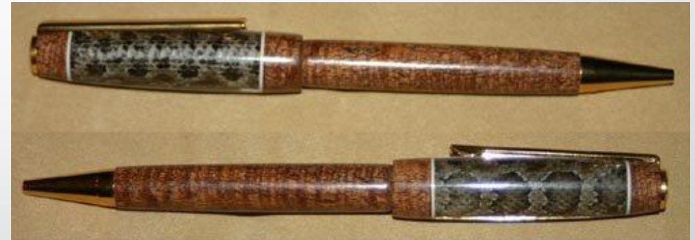
Snakeskin ~ 2004 "its_virgil" Don Ward