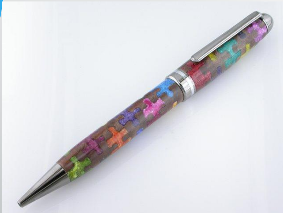
Puzzle Pen – Feb 2005 Btboone – Bruce Boone