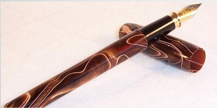
Early Kitless ~2008 "Texatdurango" George Butcher