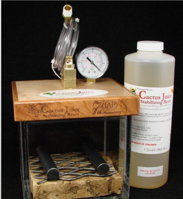
TurnTex Cactus Juice ~2010 Curtis Seebeck - MesquiteMan