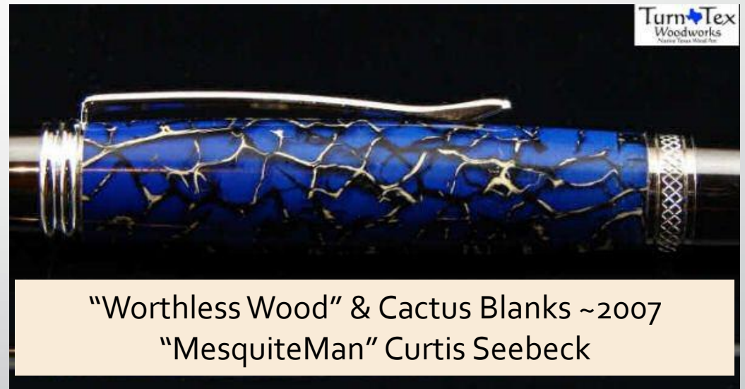
"Worthless Wood" & Cactus Blanks ~2007 "MesquiteMan" Curtis Seebeck