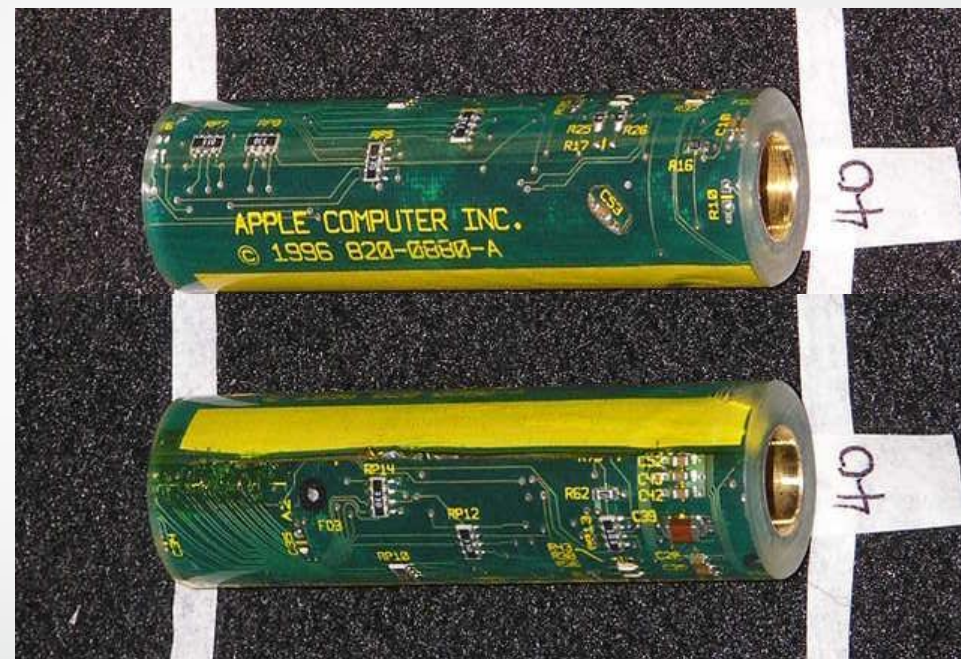
Circuit Board Pens ~ 2007