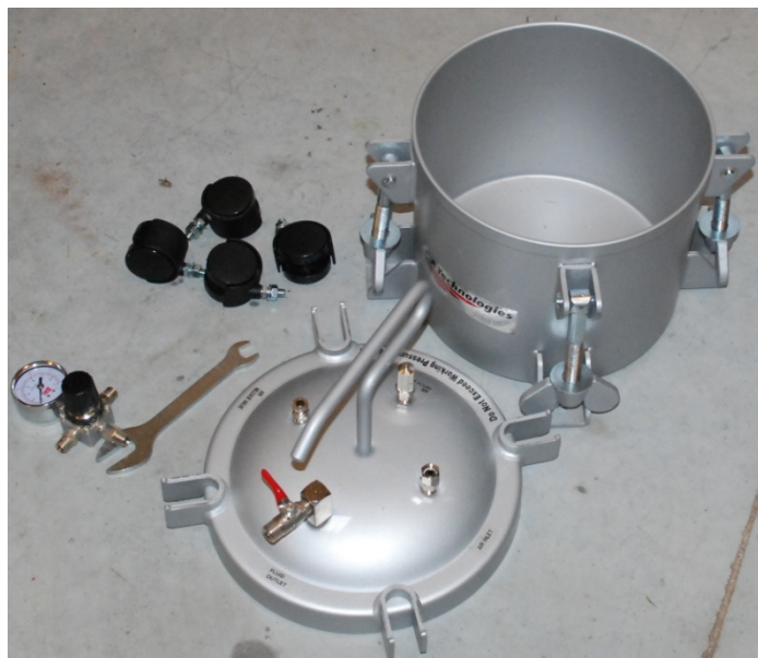
Figure 1: The pressure pot as it arrives from the manufacturer.

During my research I ran across the Finish Systems Pressure Pot made by C.A. Technologies. It looked like it was sturdy and well built - so I spent a little more than others I have seen and purchased it. The pressure pot comes from the company well shipped with the pot, the lid, four casters, a pressure gauge, and a wrench for tightening the lid down before pressurizing (Figure 1). The pot is 8 3/4" deep and 10 3/8" in diameter.