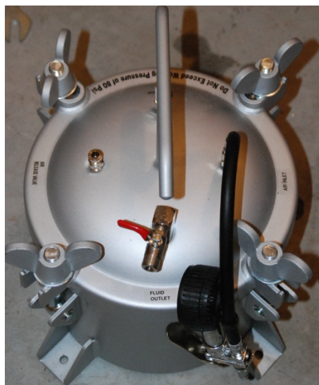
Figure 4: Completed pressure pot with tire inflator attached

To attach the hose to the pot, wrap a few rounds of Teflon tape around the hose and screw the hose into the inlet fitting of the pressure pot. Tighten with a few wrenches and you are completed (Figure 4).