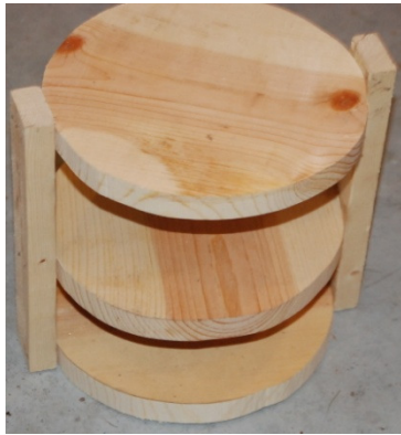
Figure 7: Homemade Shelf

The only other thing you will need is a rack to go in the pot. I made one in 15 minutes with the band saw and some leftover wood (Figure 7 & 8). Besides holding two molds, the rack will deflect the air when you pressurize the pot - otherwise the air is blowing right onto the resin and would create a mess. Even with my rack, I still line the pot with wax paper. Have yet to spill even a drop, but better safe than sorry!