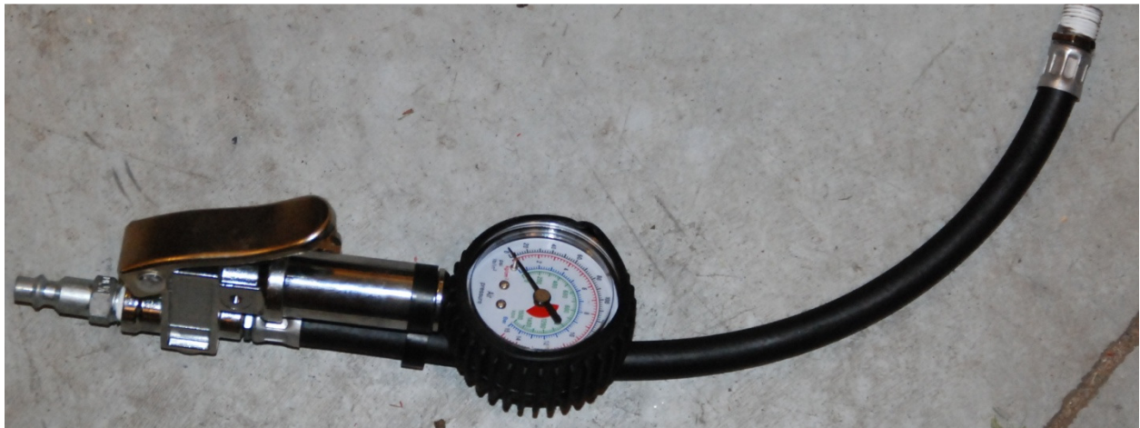
Figure 3: Harbor Freight's Dual Chuck Tire Inflator with Dial Gauge (Item #: 68271) with Quick Disconnect attached

I eventually made it to HF and picked up the unit for under $15.00 (in 2011). You will want to attach a quick disconnect to this too, so pick one up at HF while you are there. When you get it home, remove the dual tire chuck and attach the quick disconnect (using a few rounds of Teflon tape, as seen in Figure 3). Lesson = plan a trip to harbor freight, don't mess around trying to find it somewhere else or put it together, you will waste your time and your money.