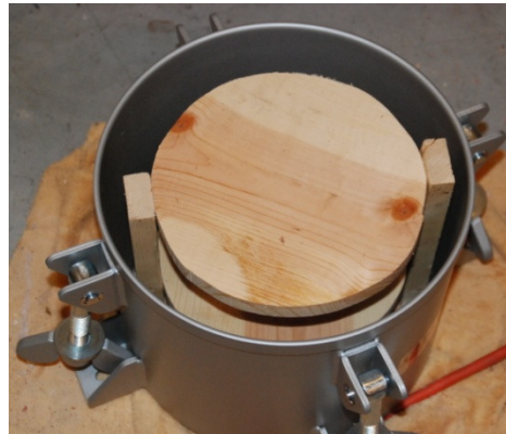
Figure 8: Shelf in place within the pot

Hope this helps. Let me know if you have any other questions – I had plenty when I started, so don't be shy.