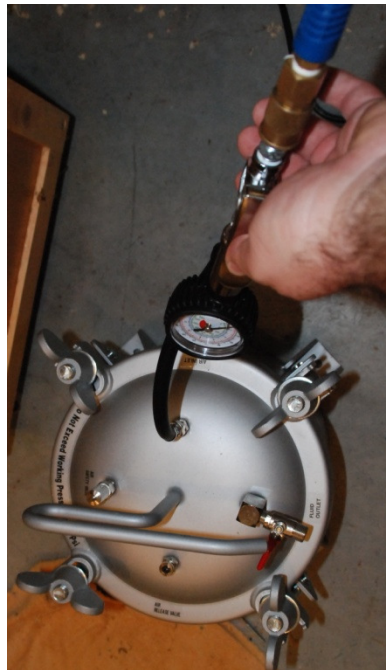
Figure 6: To fill, with the air compressor on, simply depress the trigger for a few seconds and allow the pot to pressurize

The pressure pot has served me well. I have probably used it 10 - 15 times so far with only one minor issue. I can't seem to get a good seal - I seem to always have a slow leak, but so slow it hasn't impacted my casting as far as I can tell. When I start, I pressurize it up to about 60 lbs